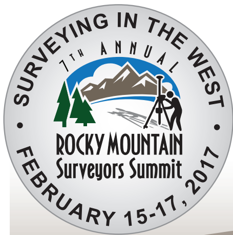
EXHIBIT & SPONSORSHIP PROGRAM

Professional Land Surveyors of Colorado invite you to participate in the 7 th Annual Rocky Mountain Surveyors Summit.