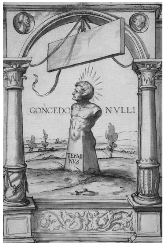
The Roman God Terminus on a boundary stone

Maybe the PLSC might bring back the celebration of Terminalia on February 23rd as a uniquely land surveyor’s day. What do you think? ■