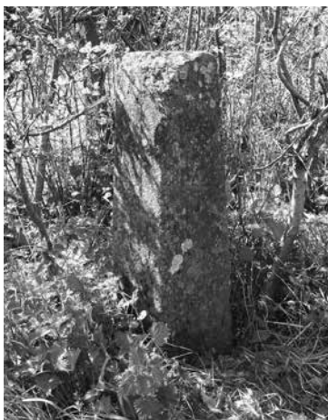
An ancient boundary stone.

Most educated surveyors know of the Egyptian tomb painting of the “rope stretchers” used to reestablish the farm boundaries after the annual Nile flooding wiped out